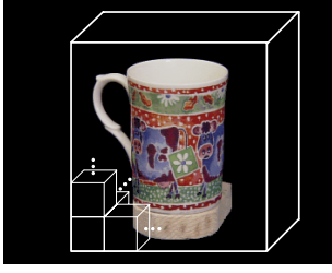
Figure 1: Bounding box of the volume with four voxels for illustration purposes.