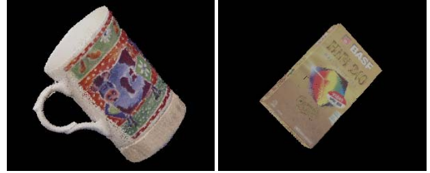
Figure 9: Reconstructed images for viewing positions that are not part of the camera sequence.