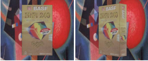
Figure 6: Original frames 0 and 3 of the cassette sequence.