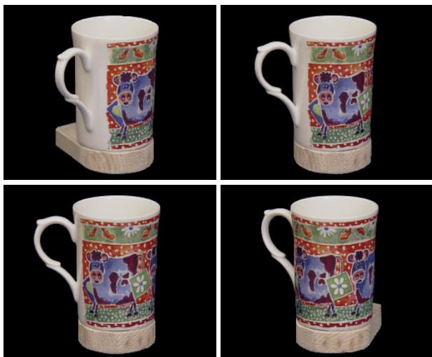
Figure 2: Original frames 0, 3, 6, and 9 of the cup sequence.

The first sequence is an 11 view sequence of a cup with homogeneous background recorded with a video camera. The original frames 0, 3, 6, and 9 are shown in Fig. 2. From this sequence we