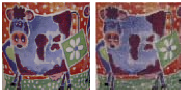
Figure 5: Magnified frame 0 original (left) and rendered (right). The rendered model shows the same sharpness as the original frame.

version of the original and reconstructed image for view 0 of the cup sequence. It can be seen that the rendered 3-D model has about the same sharpness as in the original view.