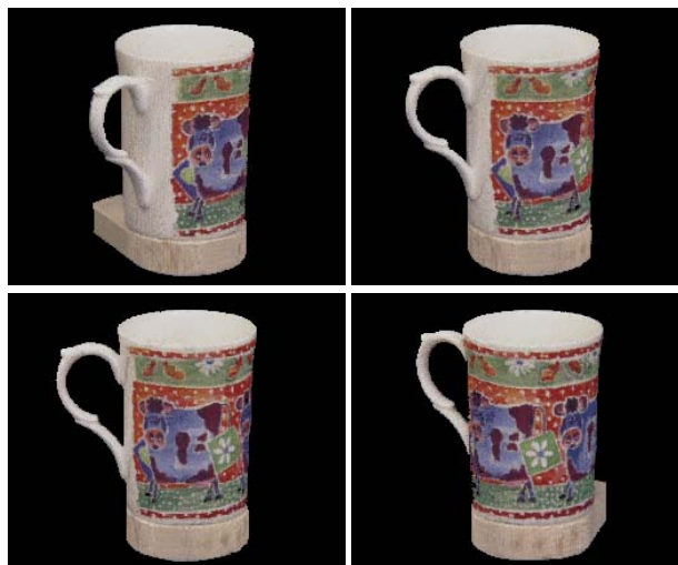
Figure 4: Rendered 3-D model for the same viewing positions as in Fig. 2.

a virtual image plane is shown in Fig. 4. Fig. 5 shows a zoomed