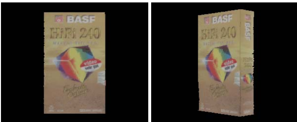
Figure 8: Rendered 3-D model for the same viewing positions as in Fig. 6.

In this paper we presented a voxel-based approach for the 3-D reconstruction of real world objects from multiple calibrated camera views. The algorithm first extracts a set of hypotheses for each voxel in the scene and then exploits the back-projection of the visible surface voxels to remove all hypotheses which are not consistent with the individual camera views. The description of the object is a set of voxels with associated color values that can be used for either surface extraction or the production of new intermediate views which were not available in the initial set of camera views.