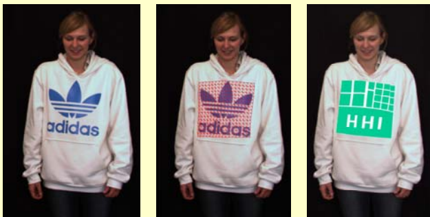
Original scene, estimated mesh deformation, virtual logo