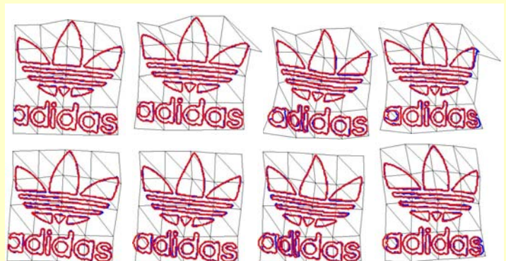
Example mesh deformations and outline of target logo (red) and deformed model (blue). Upper line: no spatial smoothing, lower line: with spatial smoothing