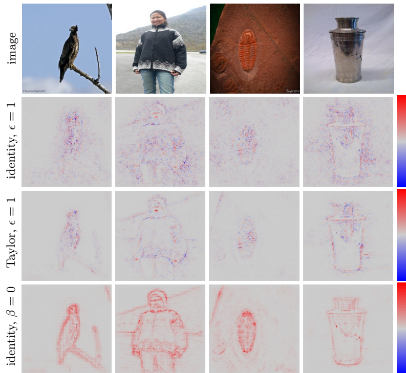
Fig. 3. Top row shows original unwarped image. Remaining rows show heatmaps produced by various parameters of the LRP method.