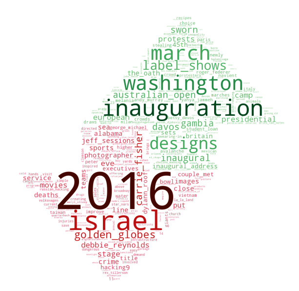
Figure 2: Relevant words in NY Times article snippets during the week of president Trump's inauguration ( green/up ) and three weeks prior ( red/down ).